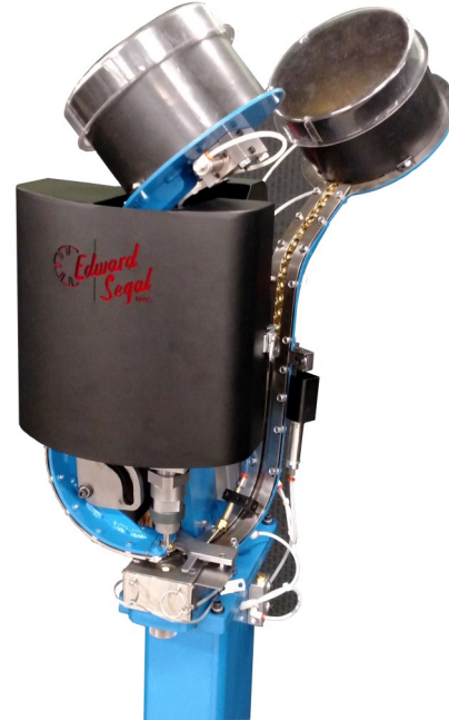
(Shown on Pedestal Base with Barrier Guarding Removed)

The Edward Segal Inc. 3PGW brings fully automatic capabilities in a smaller machine and lower price! It is simple to operate and maintain, and is fully manufactured and supported in the USA!